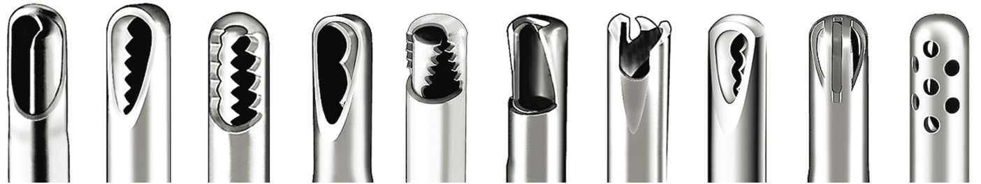
Resector Aggressive Plus Tomcat Scalloped Cougar End End Cutter True End Double Bite Slotted Whisker Whisker