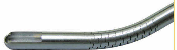
Proprietary "puzzle piece" Laser Cut Design shaver inner-housing