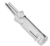
3957 ILA™ 52 Stapler ILA™ 52 Stapler Unit of Measure / BX - Quantity / 1