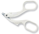
150462 Premium™ Skin Staple Remover Premium™ Skin Staple Remover Unit of Measure / Box - Quantity / 12