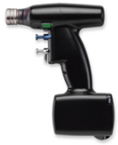
IDRVULTRA1 iDrive™ Ultra Powered Handle iDrive™ Ultra Powered Handle Unit of Measure / BX - Quantity / 1