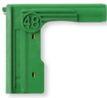
TA3048L TA™ 30 - 4.8, Loading Unit TA™ 30 - 4.8, Loading Unit Unit of Measure / BX - Quantity / 6